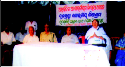
Prayer Meeting and Raja Utsava in Jajpur Subjail for blissful change.