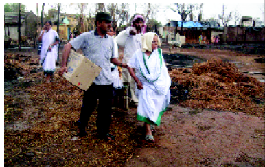
Helping hand and consolation to the severe fire accident affected people of Kanapura, Odisha, by I.I.P.M.