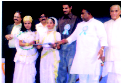
Students of Udayagiri Sikhyashram receiving Sishu Prativa and Unicef Award from Ministers and Unicef Representative.