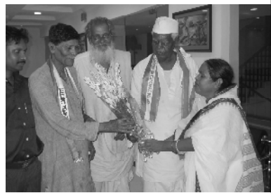
Freedom fighters are honoured by the movement on the Independence day 2010.