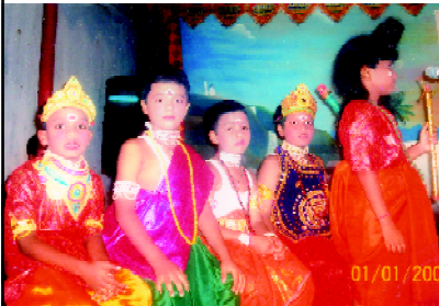
A play by the Students of C. Sovaniya Sikhyashram.