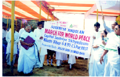
World Peace March.