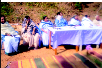
The Decency Flag hoisting occasion, on 1 st January.